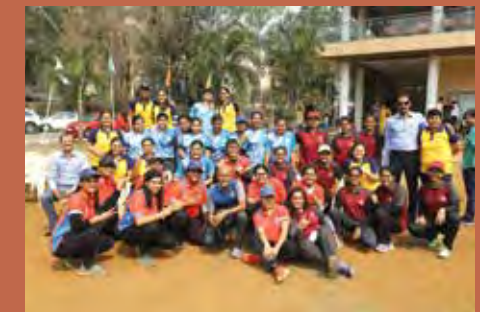
Winners of Navneet Cricket Cup posing for camera