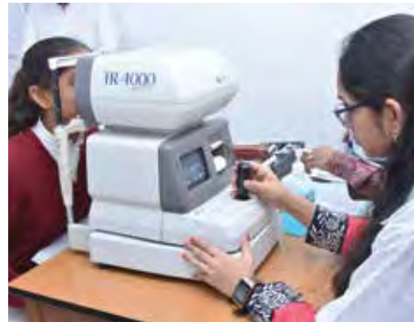
Eye check-up underway at Medical Camp, Bidada, Gujarat