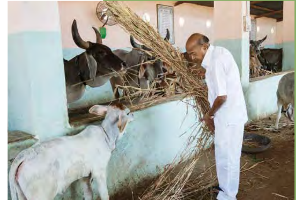
Animal shelters supported by the Navneet Foundation