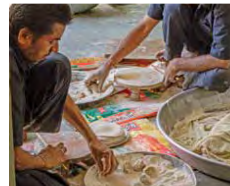
Navneet pantry for the underprivileged, Bhuj, Gujarat