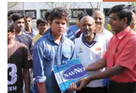
Mumbai Under-19 team visiting Navneet Factory at Dantali, Gujarat