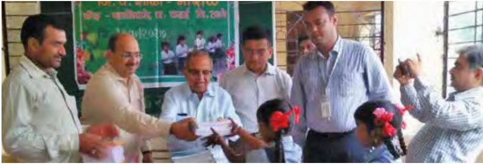
Senior Management of H N Mehta Charitable Trust, distributing school supplies at an adopted school, Maharashtra