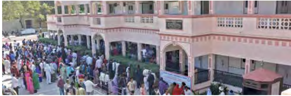
Patients at orthopaedic facility during the Bidada Mega Medical Camp