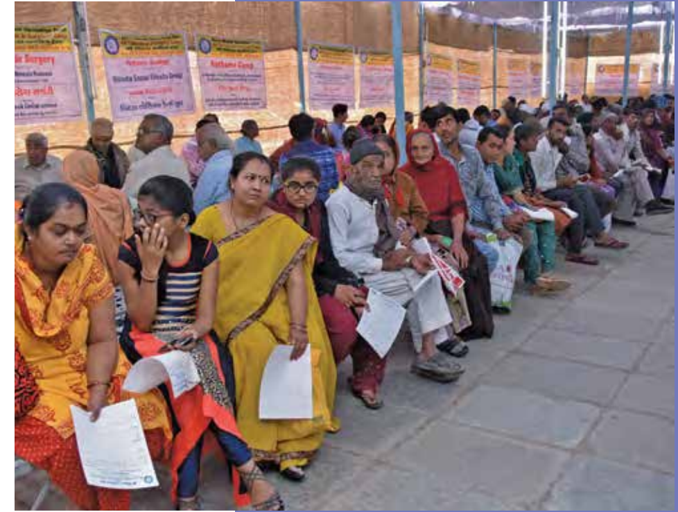
Patients waiting their turn for check-up by specialist doctors at Bidada Medical Camp, Gujarat