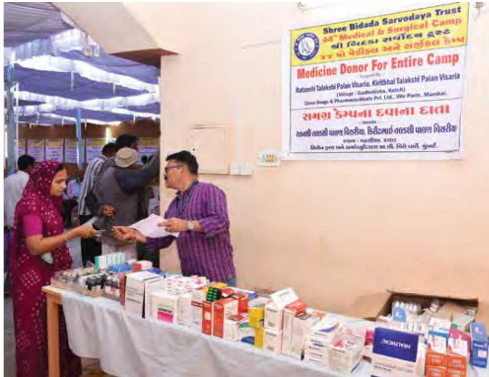
Medicines being distributed at the Bidada Mega Medical Camp