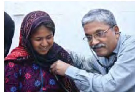
Check-up underway at Women's Medical Camp, Bhojay, Gujarat