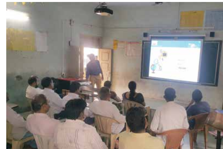
Teachers being trained to use digital learning aids at Nashik

Sheth Dhanji Devshi Kutchi Visa Oswal Kelavani Fund (DDKF) in partnership with Navneet Foundation does its best to ensure that students make the most out of given opportunities to pursue a great education and build a bright future.