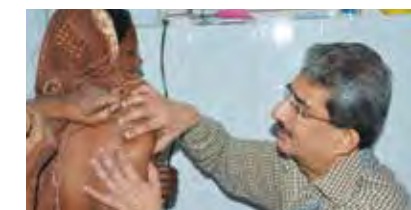
Examination underway at Bhojay Sarvodaya Hospital during women's medical camp at Bhojay, Gujarat