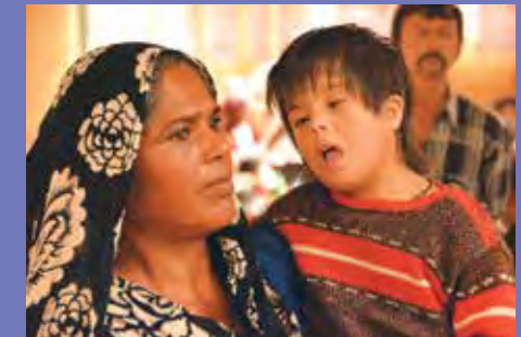
Beneficiaries of Pediatric Camp