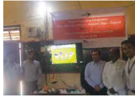
Senior Management Team of Keva Fragrances inaugurating Digital Learning Center at an adopted school in Gujarat