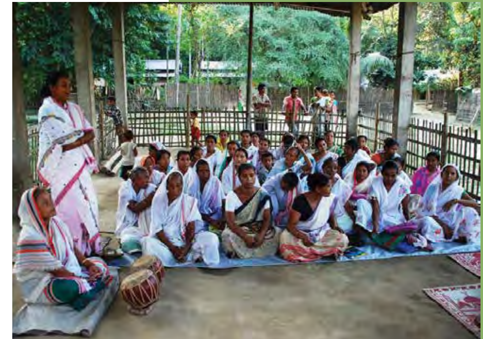
Women's support program as part of Tribal Welfare initiative