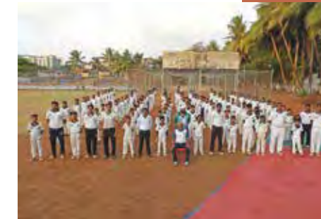
Participants of Cricket Camp conducted by Dahisar Sports Club