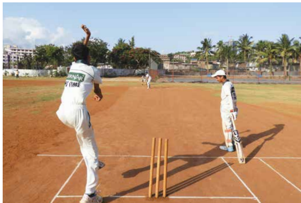
Matches underway as part of Cricket Camp by Dahisar Sports Club