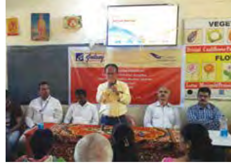
Senior Management of Galaxy Surfactants inaugurating Digital Learning Center at adopted school, Navi Mumbai