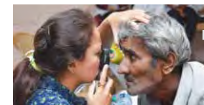
Patient undergoing eye check-up at Bidada Mega Medical Camp, Gujarat