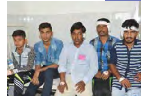
Patients after their treatment at Bidada Medical Camp, Gujarat