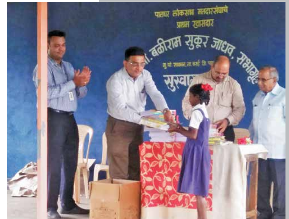
Senior Team of Sitlax India Foundation distributing school supplies at an adopted school, Maharashtra