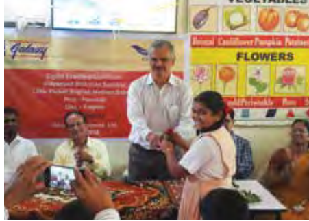
Senior Management, Galaxy Surfactants distributing school supplies to adopted school, Navi Mumbai