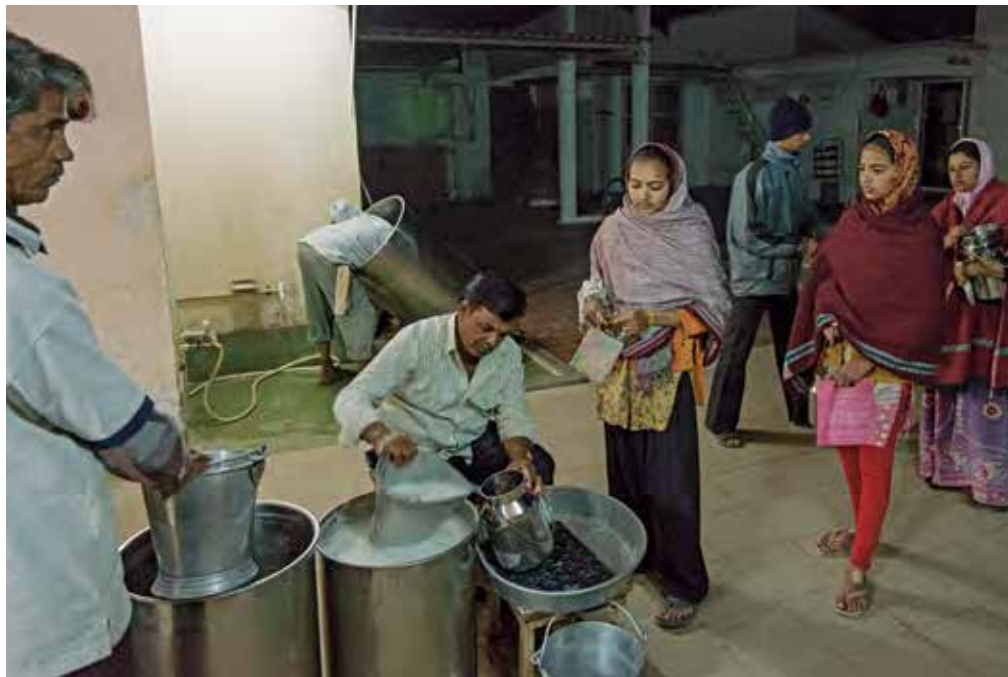
Beneficiaries queuing up at 5am before heading off to work in the scorching heat of Kutch, Gujarat