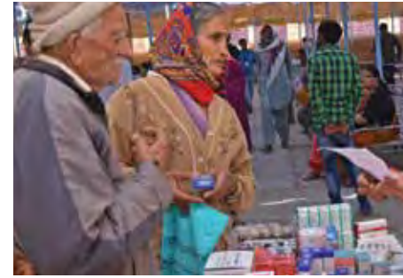
Patients availing free medicines at Medical Camp, Bidada, Gujarat