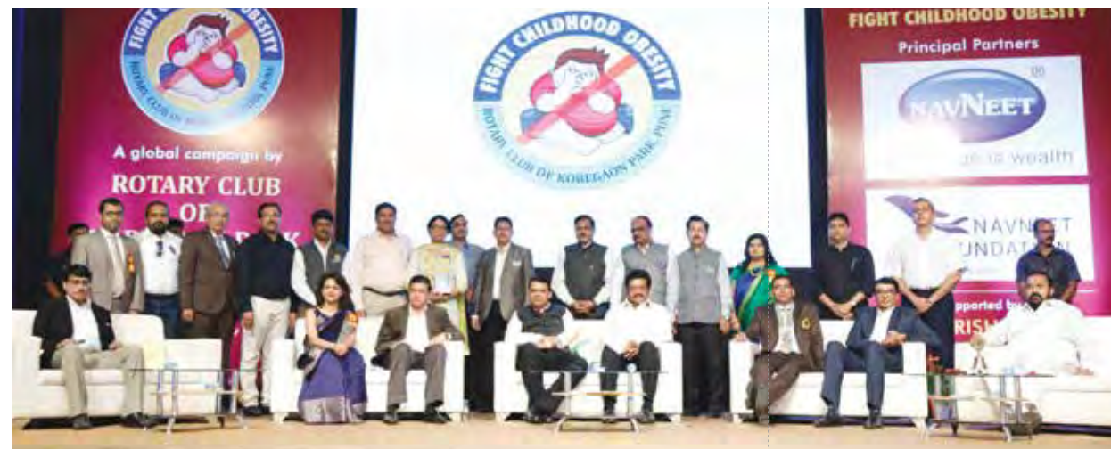
Hon'ble Chief Minister of Maharashtra, Shri Devendra Fadnavis inaugurating short film on awareness on Childhood Obesity