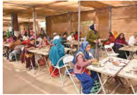
Free food being served for relatives of patients at Medical Camp