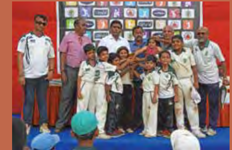
Winners of Under-12 cricket tournament at Cricket Camp by Dahisar Sports Club